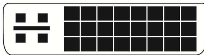
DVI-I (Dual Link)