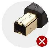
USB 2.0 Type-B