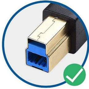
USB 3.0 Type-B