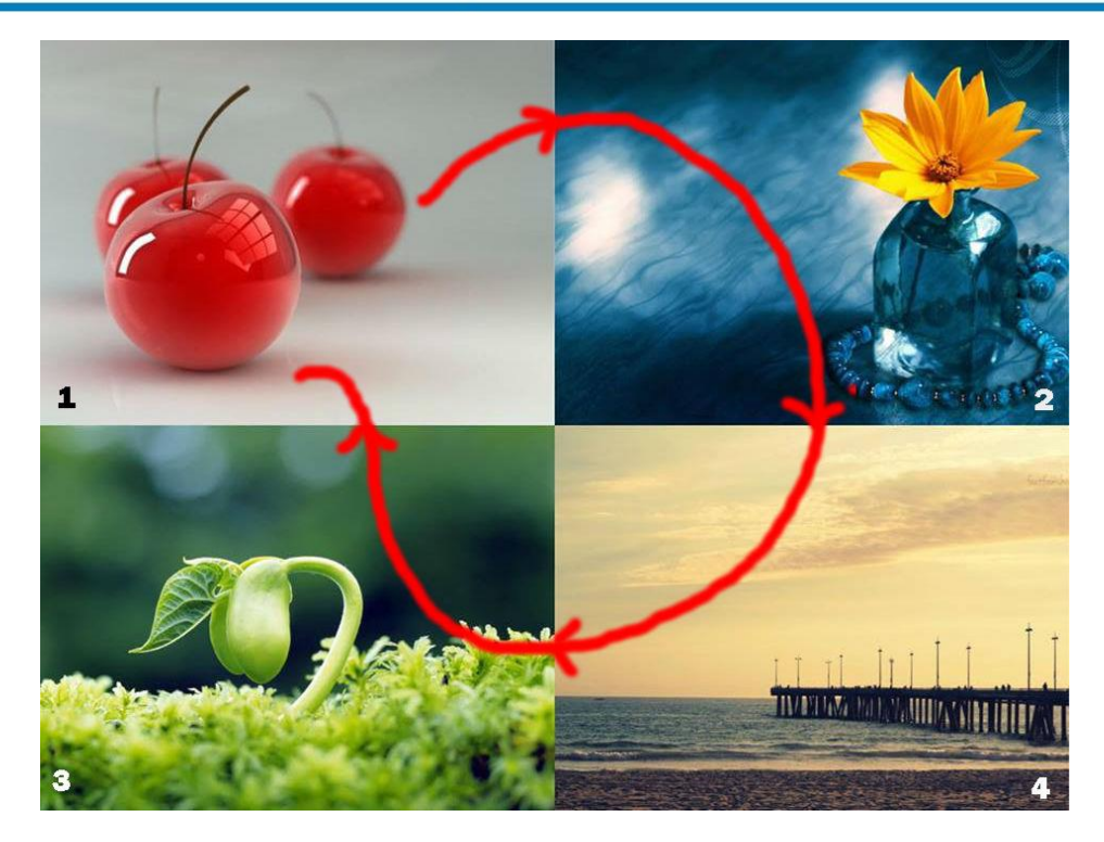
Switch between ports by simply moving the mouse cursor across each screen boundary on QSS mode.

Description : 23.8 inch Quad Screen Splitter LCD Console Drawers, 4 port DVI/USB/Audio interface. – Screen Pivot Version. - Optimize rack space. Maximize rack monitoring -