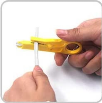
Cut the Skin

Model : ATZ NET-CRT04 Description: Crimping tool for Cat.5e/6/7