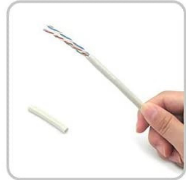
Arrange the Wires