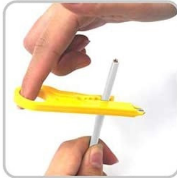
Rotate the Stripper