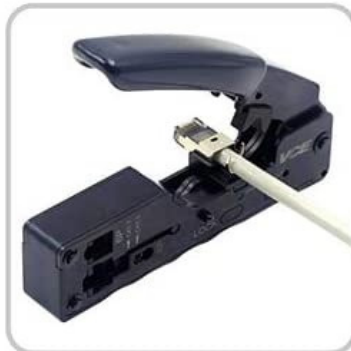
Crimping Dovetail Clip