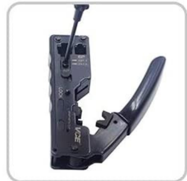
Change Crimping Model