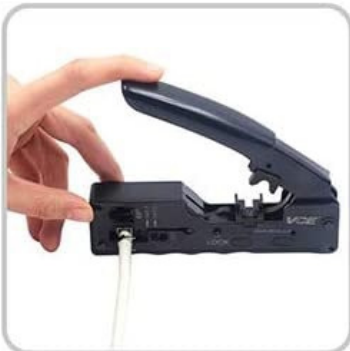
Crimping Modular Plug