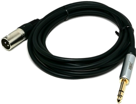
6.35mm Stereo Male to XLR Male Cable